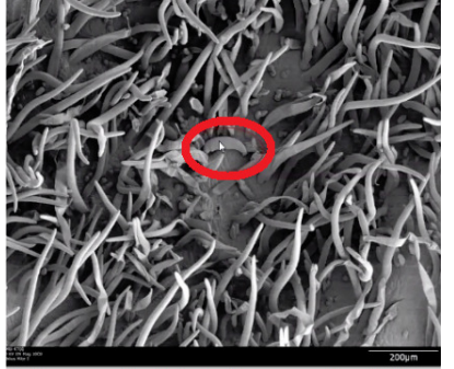
Erinose mite (circled) among the hairs of the felt-like erinum on a lychee leaf.

If you see any evidence of this pest, PLEASE REPORT IT IMMEDIATELY - especially if you see the furry brown felt on the leaves of your lychee tree. If symptoms appear, Dr. Crane recommends burning the plant. Do <u>not</u> move LEM-infested plants outside