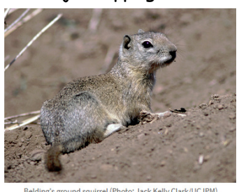
Belding's ground squirrel

They are also disease vectors, which is not as big an issue in urban areas, but becomes a major problem near forests and wild areas where they can spread plague and other diseases. Fortunately, there is no rabies in California squirrels. (Some bats do carry rabies, but squirrels, skunks, and raccoons do not - the bigger concern is distemper.)