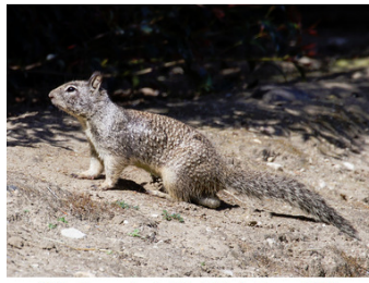
California ground squirrel

Two ground squirrel species in California cause the most damage: the California ground squirrel and Belding's ground squirrel. Not only do they eat crops, girdle trees, and mangle irrigation lines, but their burrows can cause soil erosion, water issues, and can be a major tripping hazard.